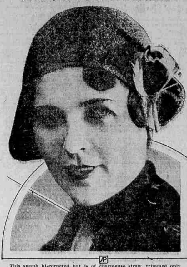
This swank hi-cornered hat is of charmuse straw, trimmed only with a cluster of gay feathers at the side. The model is by Patou and Bonwit-Teller.