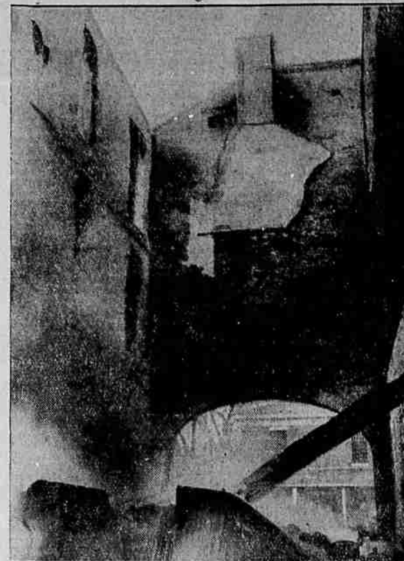
Authorities are investigating the fire that destroyed the greater portion of the main building of the Alabama state prison at Wetumpka. For a time fire threatened to destroy the two cell blocks housing 562 prisoners, among them 231 women. A riot was curbed during the blaze.