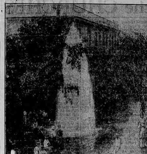
Part of the water supply of Havana, Cuba, was cut off and four persons were injured when dynamite which had been placed in a manhole exploded and damaged a water main. Here is the geyser of water which shot 30 feet into the air from the damaged pipes.