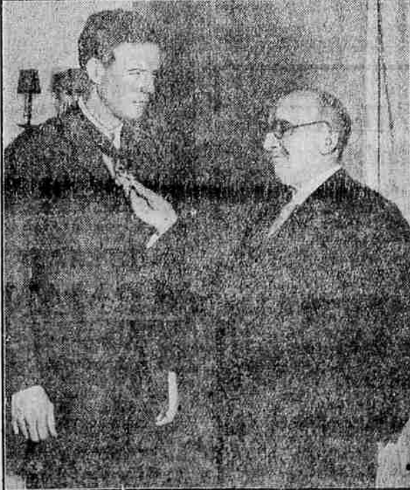
In recognition of his flight from New York to Paris in 1927, Col. Charles A. Lindbergh (left) received the cross of the legion of honor from Ambassador Paul Claudel of France at Washington, D. C.