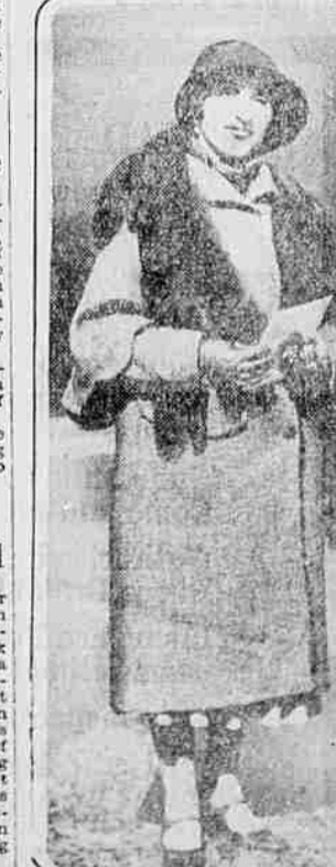
Amelita Galli-Curci, noted soprano, and John D. Rockefeller, captured together at the latter's estate in Ormond Beach, Fla. Mr. Rockefeller presented his guest with a picture of himself, a bouquet of sweet peas—and a dime.