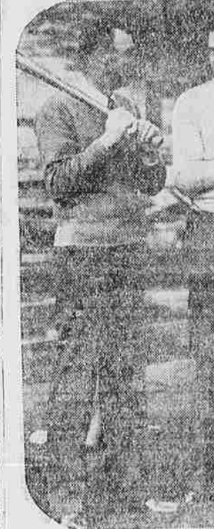
Three major league stars, all residents of San Francisco, get together for a little impromptu workout and discussion of 1931 baseball prospects. Left to right: Tony Lazzeri, New York Yankee third base man; Frank "Lefty" O'Doul, hard hitting Brooklyn outfielder, and Joe Cramer, Washington shortstop.