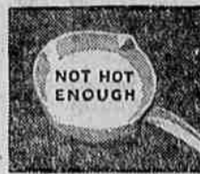
"Fry hot to fry well," is an old saying. When the fat isn't hot, the crust doesn't form quickly. Too much fat absorbed keeps the fried food from being light and crisp.