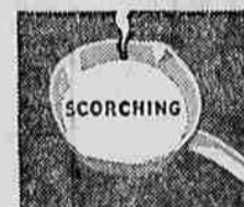
Smoking fat is burning fat. Acrolein is forming and mars the wholesomeness and flavor.