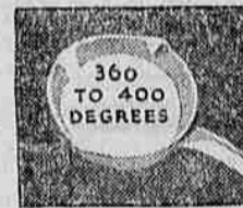
You can heat Wesson Oil hot enough to fry perfectly before it begins to burn. Even at 50 degrees above correct frying temperature Wesson Oil keeps its goodness, does not burn.