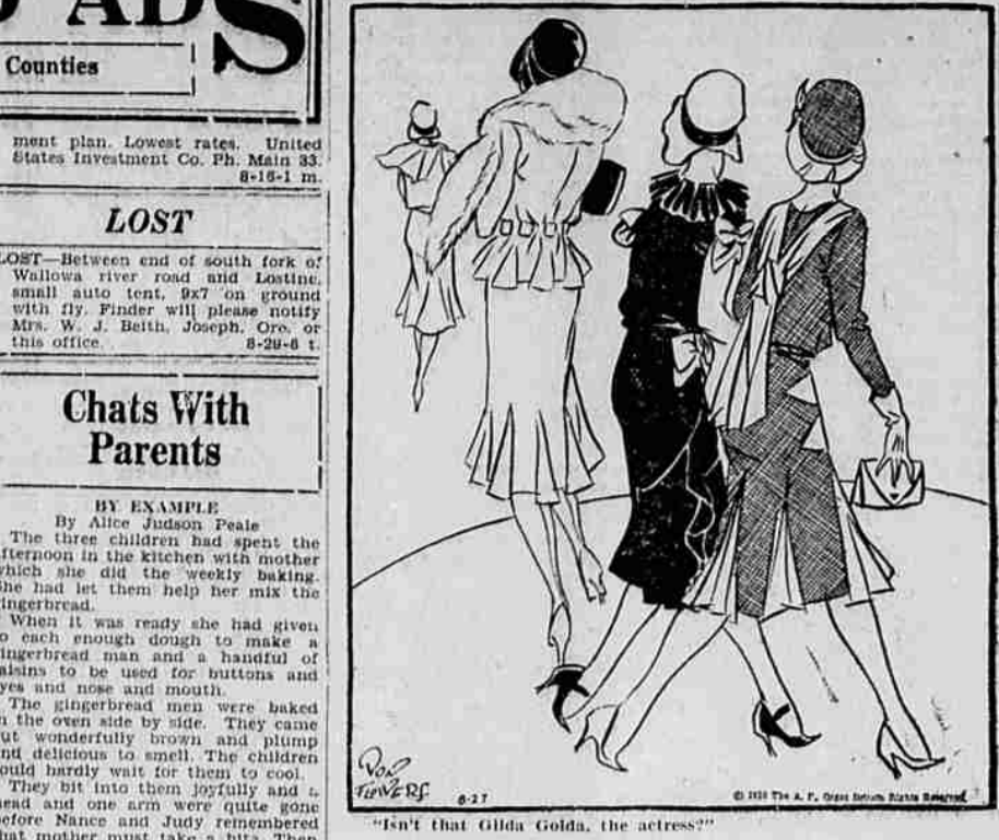
"Isn't that Gilda Golda, the actress?" "Yeah, but she quit the stage four husbands ago."