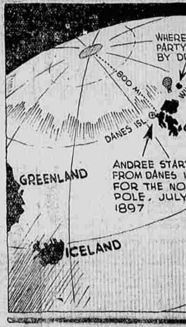
The three years after the first bold attempt to reach the earth's northern axis by air, the Arctic wastes have given up the bodies of the ill-fated Swedish balloon party of 1907, all three members of the expedition. At their right, the balloon they used. Below—Map showing starting point and end of the expedition, and the actual take-off of the daring attempt.