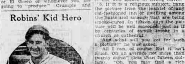
The sensational play of Al Lopez, 22-year-old catcher, has been a mighty factor in the drive of the Brooklyn Robins pennant ward.