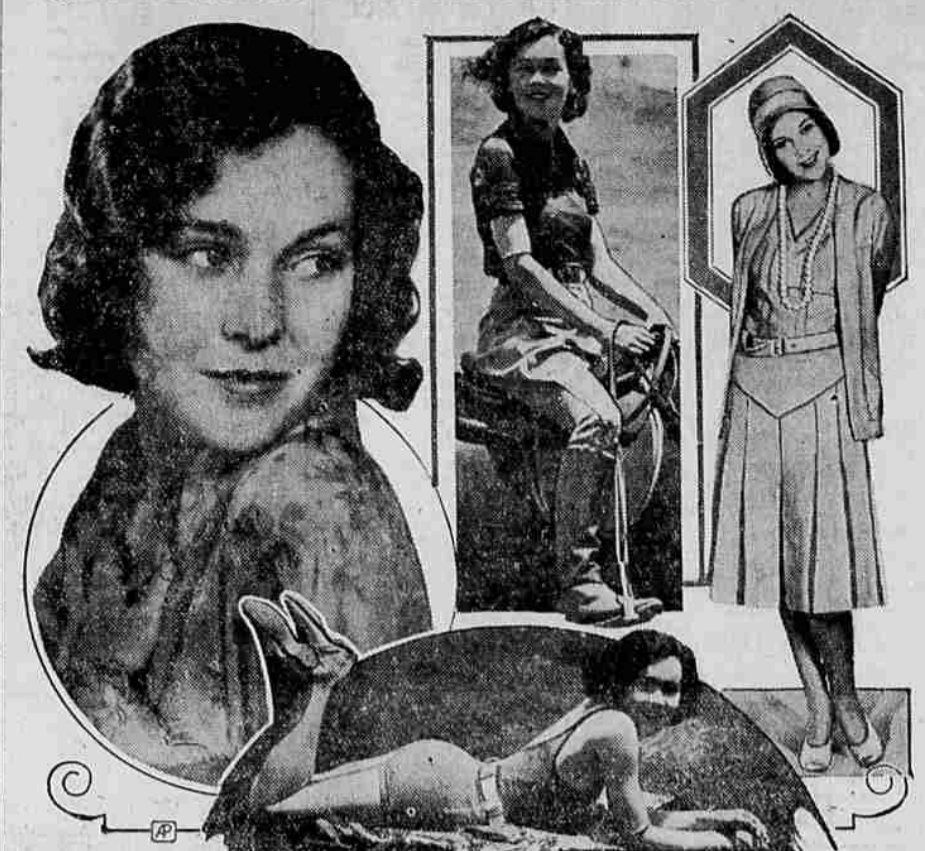
Maureen O'Sullivan was just another colleen near Dublin a year ago. Now she's the talk of the talkies. Here she is in close-up and various other poses.