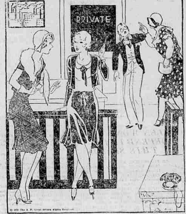
"He's my boss."

Trade Mark Registration Applied For U. S. Patent Office