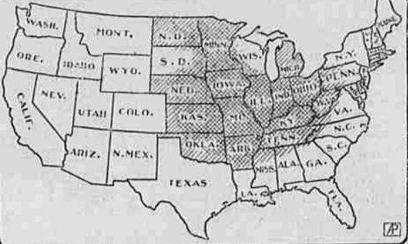
An enormous toll has been taken by heat and drought in the nation's farm areas. Shaded portion of map above shows areas most seriously affected.