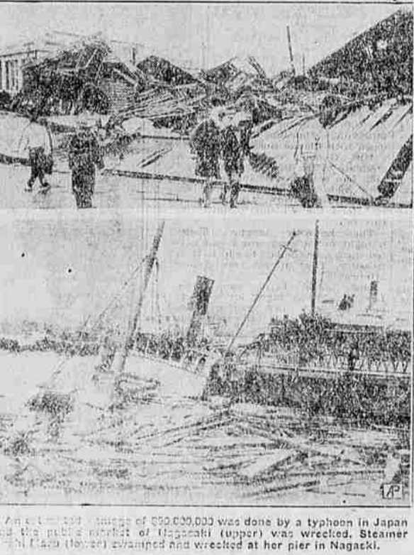
Ancient ship, image of $50,000,000 was done by a typhoon in Japan and the public market of Nagasaki (upper) was wrecked. Steamer (lower) swamped and wrecked at her pier in Nagasaki.