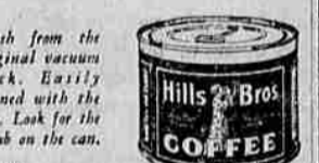
Fresh from the original vacuum pack. Easily opened with the key. Look for the Arab on the can. © 1930