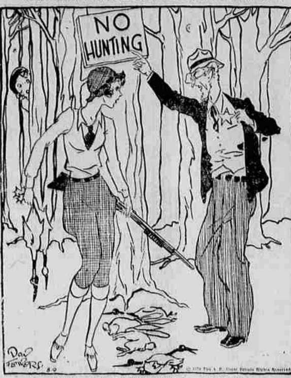
"Sorry, mister, I didn't know it was loaded."