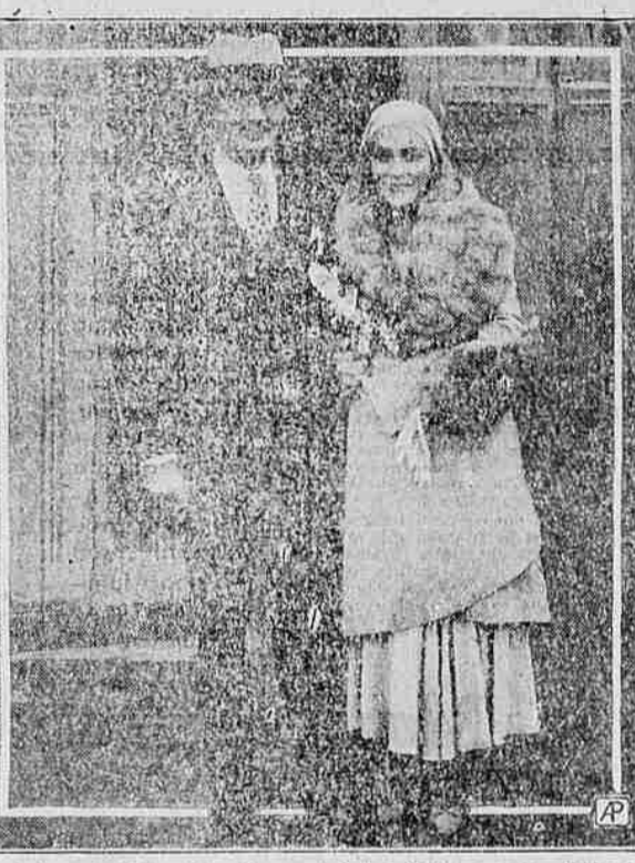
Dolores Del Rio of the films and Cedric Gibbons, screen director, immediately after their marriage in Santa Barbara, Cal.