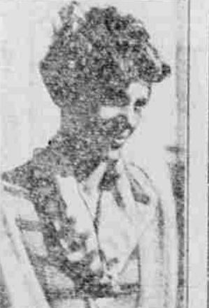
Amelia Earhart, first woman to fly the Atlantic, plans to enter the national air derby for women. The race will be from Long Beach, Cal., to Chicago starting August 17.