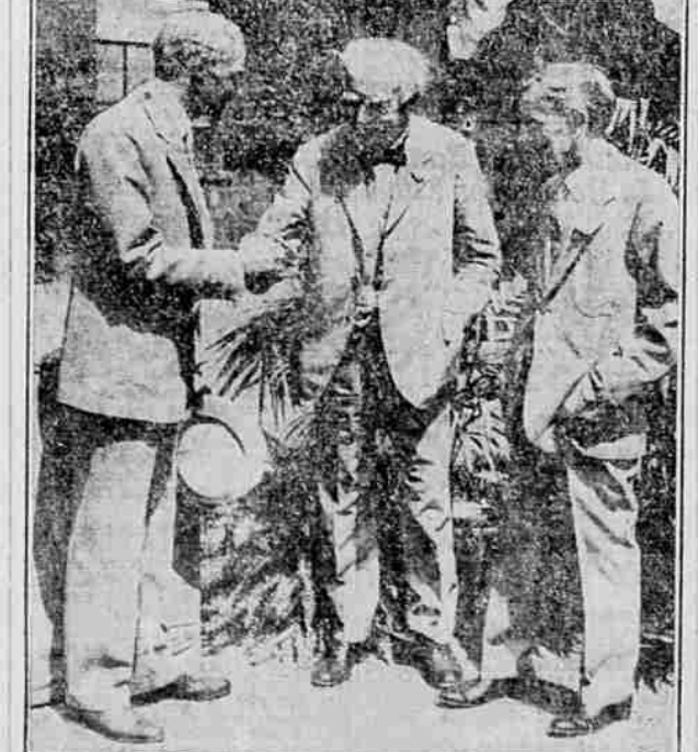
Henry Ford (left) celebrated his sixty-seventh birthday with his two closest friends, Thomas A. Edison (center) and Harvey W. Firestone, tire manufacturer. They are shown at Mr. Edison's home in West Orange, N. J.