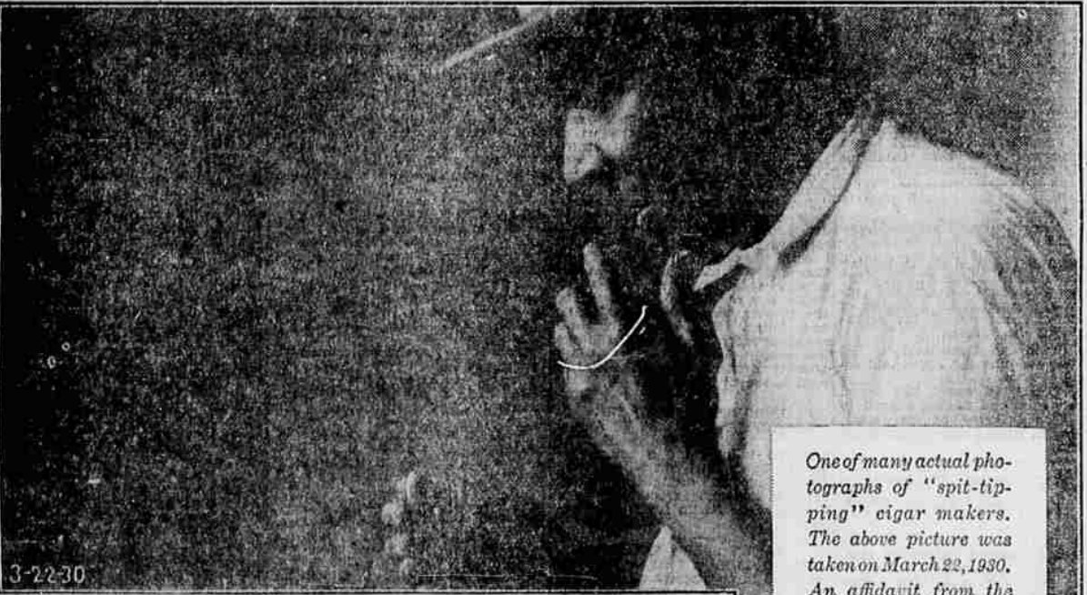
One of many actual photographs of "spit-tipping" cigar makers. The above picture was taken on March 22, 1930. An affidavit from the photographer is on file, showing that this workman used spit in finishing the end of a cigar.

... the war against Spitting is a crusade of decency... join it. smoke CERTIFIED CREMO!