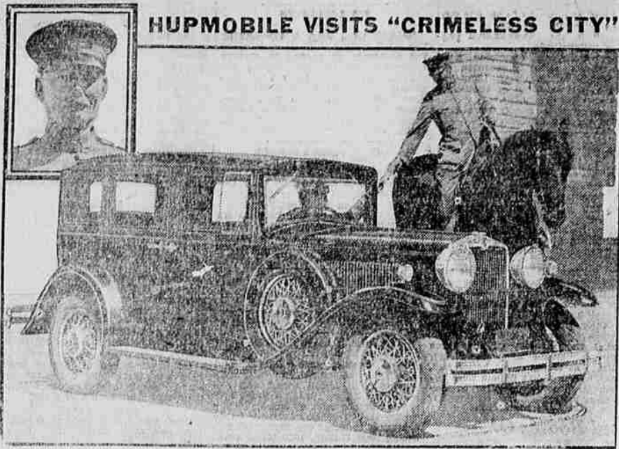
Not even the driver of this fact, 123 Horsepower Hupmobile Eight dares ignore a summons when presented by a policeman in a crimeless city since 1921. England is perhaps one of the best known policemen in the west.