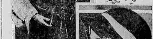
Only waiting for autumn's sharp breezes are these early fall models. The novelty brown worsted coat with the fitted, flare skirt has a beige lapin collar and novel cuffs. The black felt chaupau (below), with bandeau and crown top of beige lapin indicates a fall tendency.