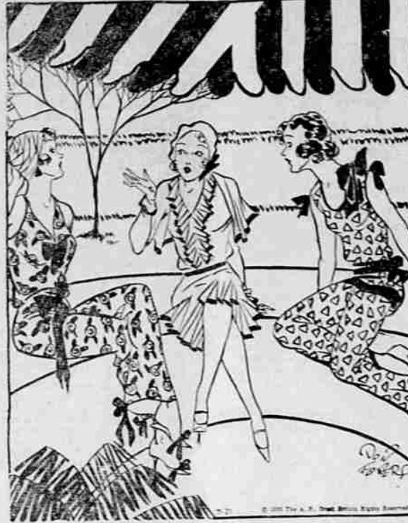
"I found out he was a fireman, so I told him to go to blazes."

Trade Mark Registration Applied For U. S. Patent Office