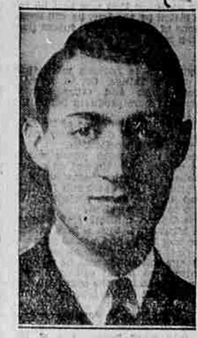
Paul Mellon, son of Secretary Mellon and heir to estate estimated at more than $500,000,000, will forego opportunity to become a financier in favor of career as a book publisher.