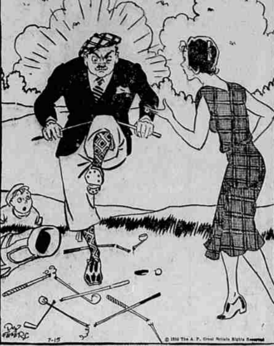
"How much for the putter?"

Trade Mark Registration Applied For U. S. Patent Office