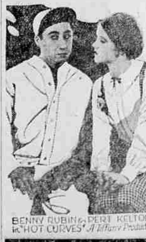
BENNY RUBIN & PERT KELTON in "HOT CURVES" A Tiffany Production