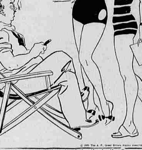
"We're taking subscriptions to clothe the heathen."

Trade Mark Registration Applied For U. S. Patent Office