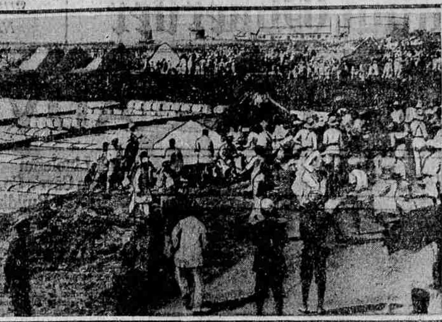
Followers of Mahatma Gandhi in the civil disobedience campaign in India are shown here raiding the Wadala salt plant, near Bombay. Scores of the salt lawbreakers were injured in skirmishes with police throughout a day-long raid.