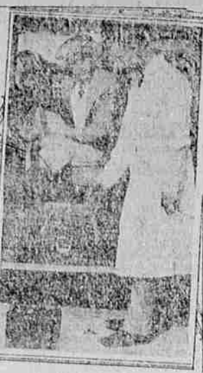
Before starting on an auto vacation trip, it is advisable to check over the automobile and camping equipment, making the necessary adjustments and changes to prevent inconveniences and delays.