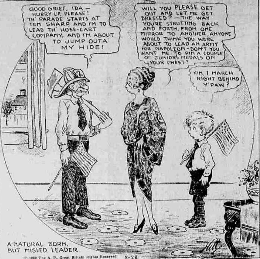
A NATURAL BORN, BUT MISLED LEADER.