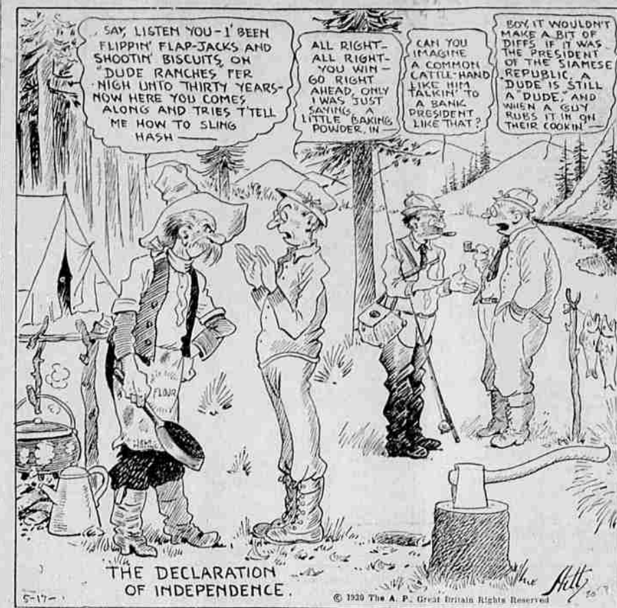
THE DECLARATION OF INDEPENDENCE.