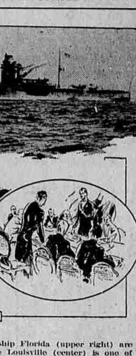
U. S. S. destroyer Farnholt (lower left) and the U. S. S. battleship Florida (upper right) are among ships bound for the scrap heap under London pact. The Louisville (center) is one of new cruisers being completed for U. S.