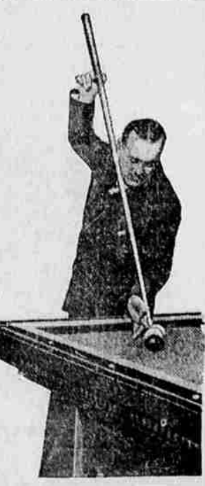
Willie Hoppe, who held the ballroom billiard championship of the world for 16 years, will be in La Grande Thursday evening at 8 o'clock at the Corner Billiard parlors and appear in exhibition games.