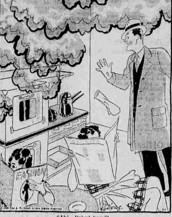
"Ah! Bucket ham!"

Trade Mark Registration Applied For U. S. Patent Office