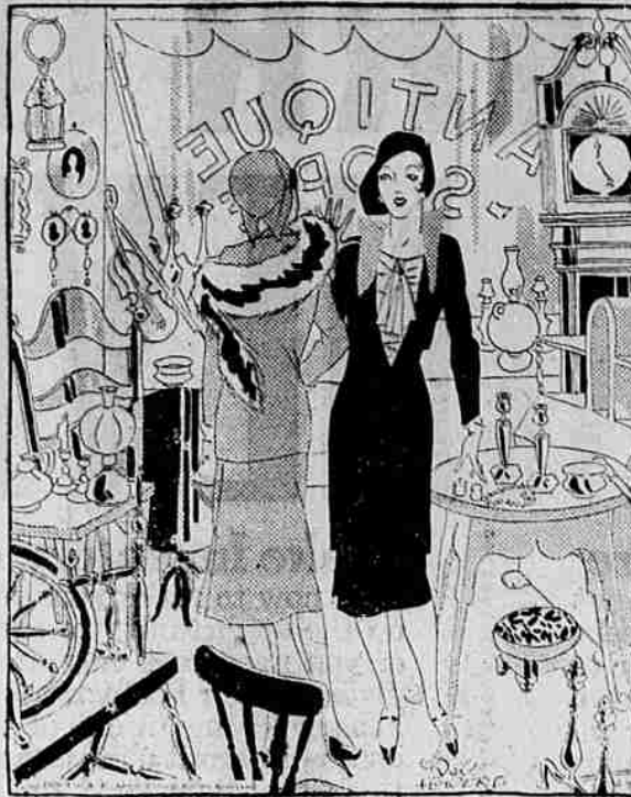
"She looked positively Victorian. Why, she was wearing her last season's ensemble."