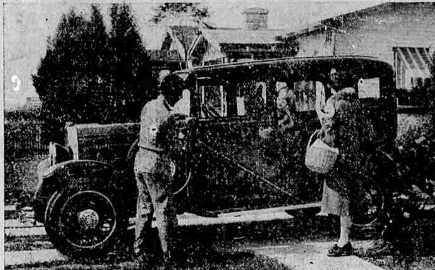
With the new low-priced six-cylinder line introduced for 1930, Dodge Brothers is back in the price class where the outstanding reputation of the product was established. In fact, the new six-cylinder line includes the lowest-priced closed car Dodge Brothers has ever offered—the sedan shown in the accompanying spring-time scene sells for $865.00 as the factory.