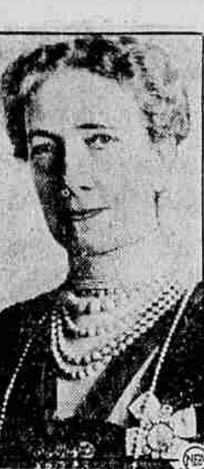
Queen Victoria of Sweden, long an invalid, died in Rome yesterday. King Gustave was at her bedside.