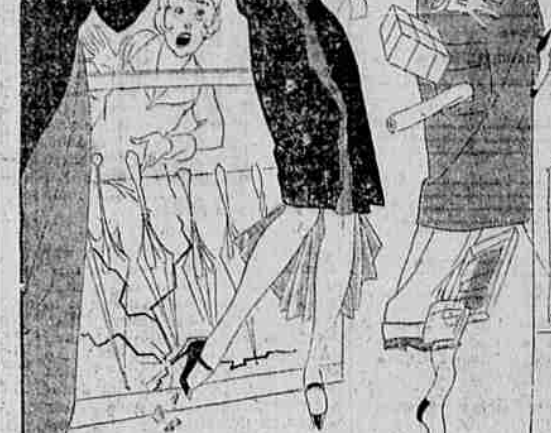
Heally, Madame, it's most unlucky to—

Trade Mark Registration Applied For U. S. Patent Office