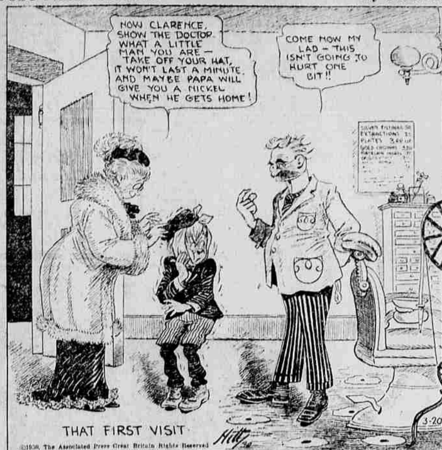
THAT FIRST VISIT