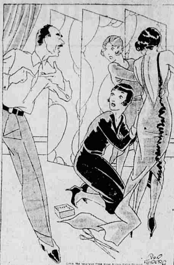
It's not asking too much, could I get a button sewed on?"