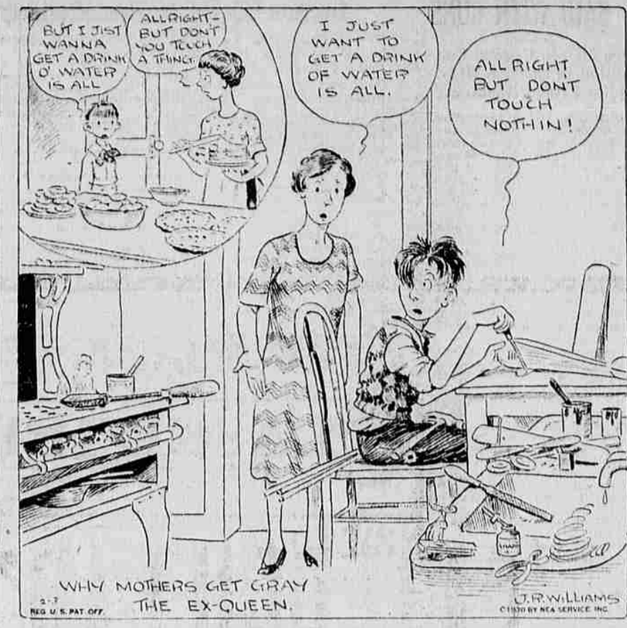
WHY MOTHERS GET GRAY THE EX-QUEEN.