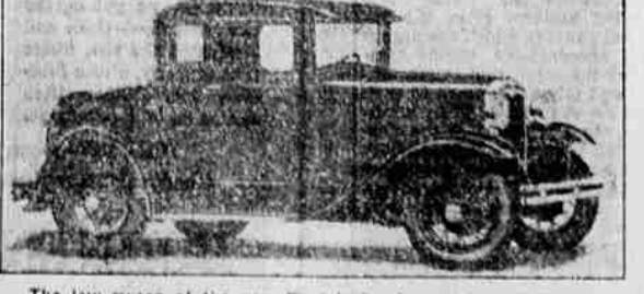
The low sweep of the new Ford body changes is well illustrated from new radiator and hood to flaring rear fender in this picture of the Ford coupe.

New York physicist says that synthetic life is about to be developed, and we suppose that in due course tariff protection will be demanded for an infant industry.