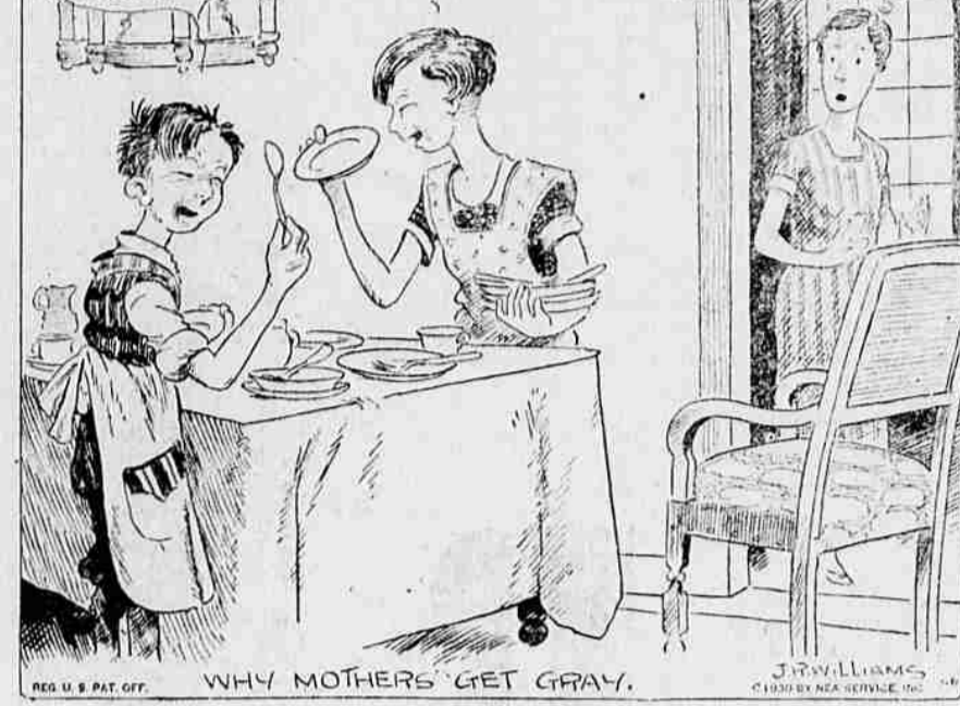
WHY MOTHERS GET GRAY.

HERE'S ONE I THINK IT'S KINDA HARD T' TELL WITH AT THIN, LIGHT COLORED SOUP. HERE'S ONE WITH JUST ONE CRUMB ON IT, BUT I THINK THAT JUST GOT ON ACCIDENTLY. IT TAKES TWO SECONDS TO WASH A SPOON OR A SAUCER AND FIVE TO TEN MINUTES TO FIND ONE THAT DOESN'T NEED WASHING. DON'T TELL ME EDUCATION HELPS EVERY BODY.