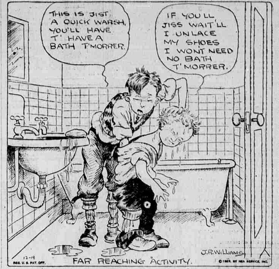
12-19 REG. U. S. PAT. OFF. FAR REACHING ACTIVITY.