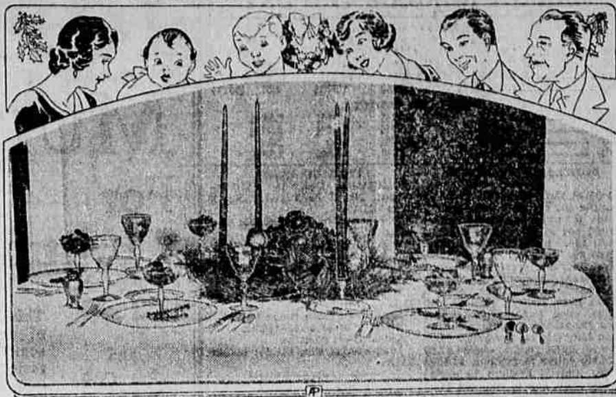
Here is an attractive dinner table, prepared in the correct way for the Christmas dinner, and delightfully inviting to the members of the family.