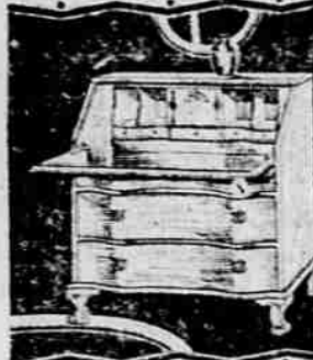
Gov. Winthrop Desks $65.00 and $75.00

Here is another leader among Christmas gifts of furniture. We have them in walnut or mahogany finish and in a variety of styles, all at very low prices.