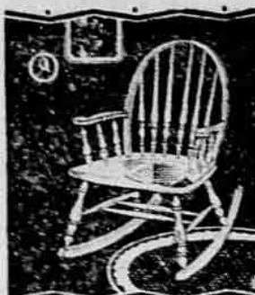
Windsor Rockers $12.00 to $35.00

Yes, it's the popular Martha Washington style, and you may have your choice of walnut or mahogany finish. An ideal gift for wife or mother.