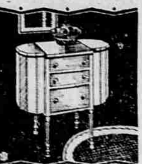
Sewing Cabinet $12.75 to $37.50

Brighten up the home for Christmas by giving some member of the family an attractive mirror. See our splendid showing.