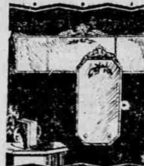
Sparkling New Mirrors $4.75 to $35.00

Here is a gift that any woman will genuinely appreciate, especially if she entertains frequently. Drop leaf styles in mahogany or walnut finish at remarkably low prices.