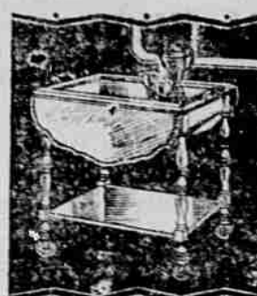
Give Her A Tea Cart! $29.50 to $65.00

No other gift is quite so popular for men. Make your selections from our large stock of the newest designs and finishes. A price to suit every purse.