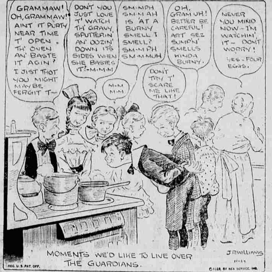
MOMENTS WE'D LIKE TO LIVE OVER THE GUARDIANS.