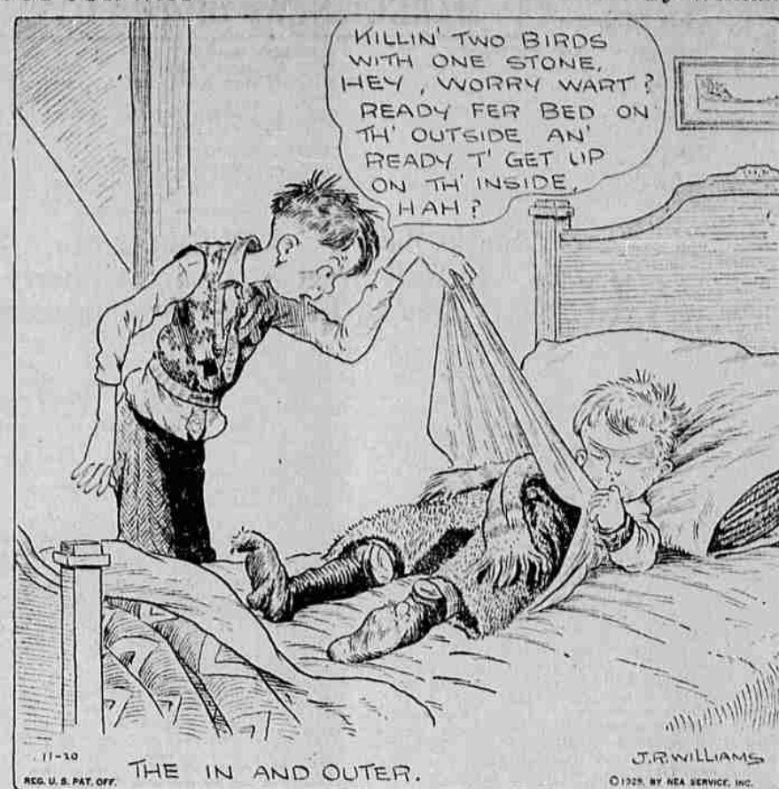
THE IN AND OUTER. ©1929, BY NEA SERVICE, INC.