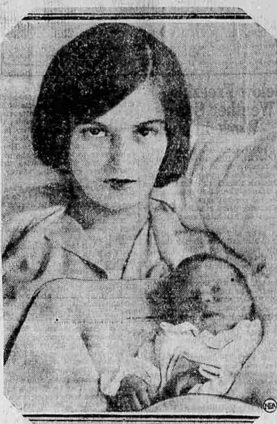
It wasn't an air male, as might be supposed, but a 7 1/2-pound daughter who was born in an airplane flying 1200 feet above Miami, Fla. The mother and baby "airliss" are pictured above after the first aerial birth on record. In the "flying maternity hospital"—a large cabin plane—were nurses, a doctor, relatives of the mother, and two pilots. An airy name is being sought for the child.

ined in an asylum. Summerville also said Kirk was asked to watch out for him as "I feel a crazy fit coming on." Kirk was unable to provide information as to the present whereabouts of the four women.