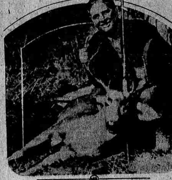
Governor George H. Dern of Utah is a mighty hunter—and this picture above proves it. When free from gubernatorial duties, he packs his hunting outfit, grabs a high-powered rifle, and hies away to southern Utah. This fine specimen was bagged on a recent trip.