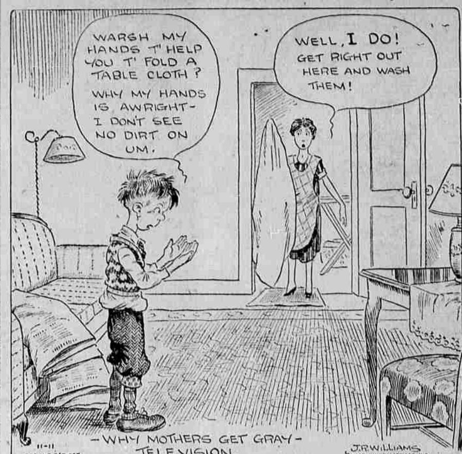
WHY MOTHERS GET GRAY TELEVISION.