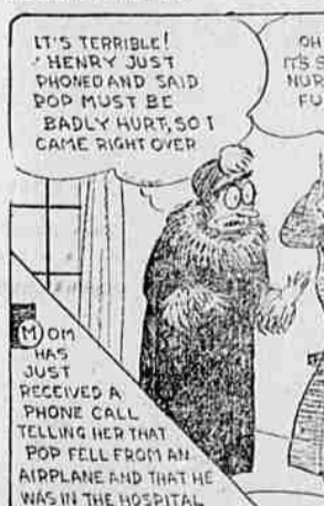
IT'S TERRIBLE! HENRY JUST PHONED AND SAID POP MUST BE BADLY HURT, SO I CAME RIGHT OVER.

OH! I KNOW IT'S SERIOUS, THE NURSE ACTED SO FUNNY OVER THE PHONE.