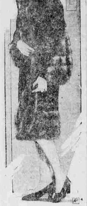
A Winter Coat in deep Burgundy with a luxurious trim of Kollinsky fur which, with a turban, gives it a distinguished ensemble.