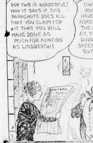
FRECKLES AND HIS FRIENDS