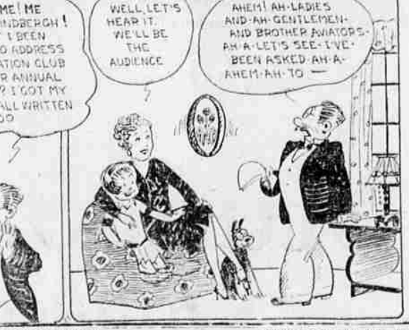
OSCAR HAS THEM GUNNING!