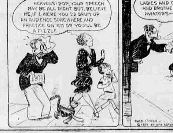
OSCAR HAS THEM GUNNING!