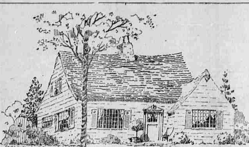
By Chester H. Disque

The above plans show a very convenient layout. Upon entering the main entrance hall we find entrance to the dining-room, stairs, and second floor, coat closet, and living-room, which is two steps below the level of the entrance hall. These steps add greatly to the decorative possibilities of the living-room.