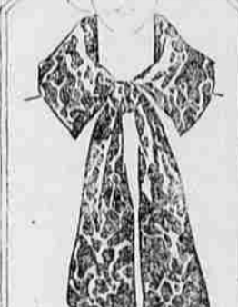
THIS SKETCH suggests a new way of handling the fur collar. This Eton collar with erasable tie is youthful and particularly effective in broadtail.

Rightness expresses of actions what straightness does of lines; and there can no more be two kinds of right action than there can be two kinds of straight lines.—Herbert Spencer.